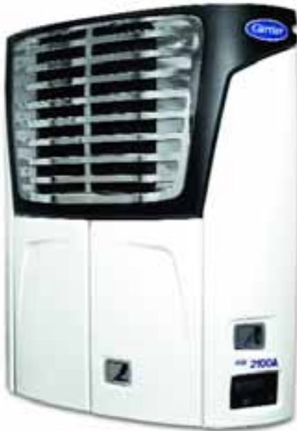
2100A shown with chrome grille/stainless latch option